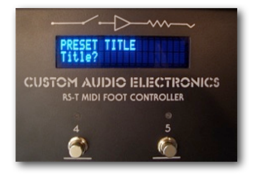
Note:Use the same Preset Title Edit procedure when titling Device and Song Names.